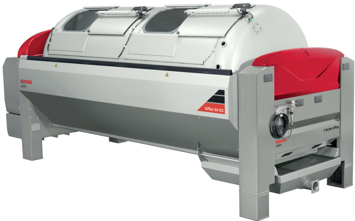
Bucher XPlus 80 ICS