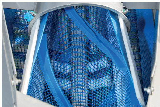
Patented draining and conveying belt