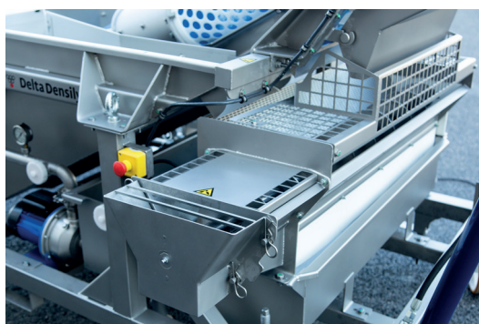
Waste evacuation screw