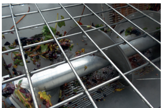
Waste evacuation screw